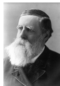
Edwin Willits (1885-1889)