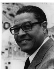
Clifton R. Wharton Jr. (1970-1978)