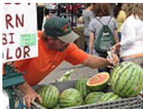
Farmers' market in Farmington, MI